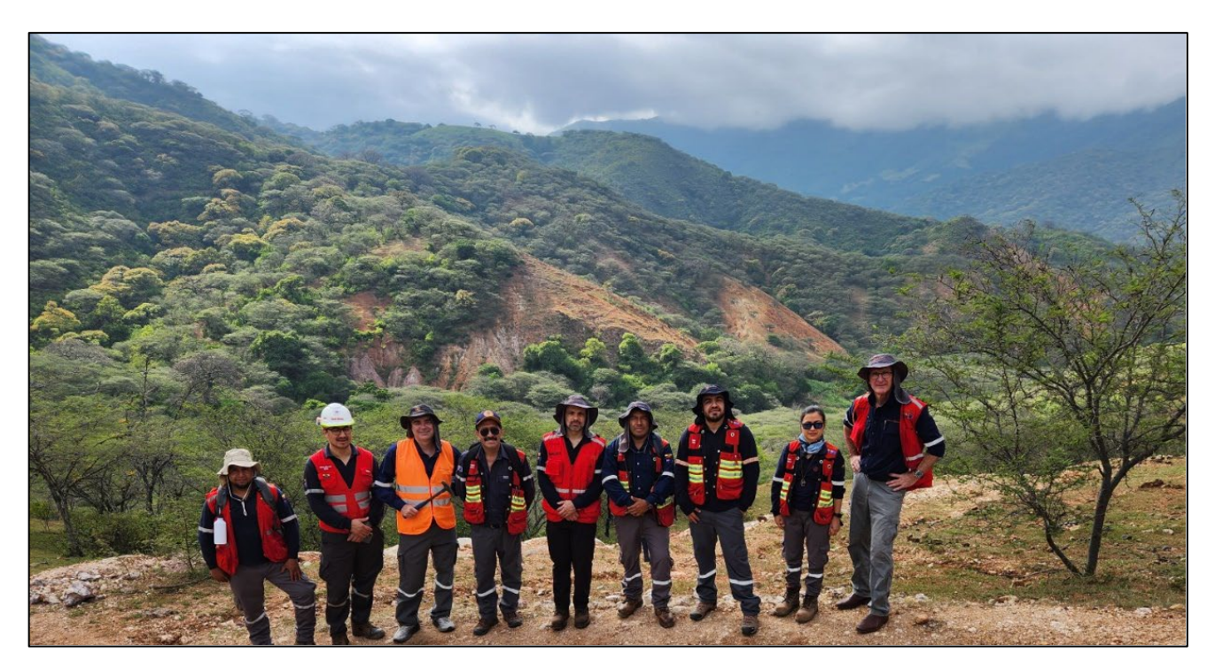
Figure 1: Panorama of the valley hosting Limon, looking East towards the Central Zone area where mineralised zones are visible at surface.

"We believe there is immense potential to create rapid and substantial value for shareholders at Limon, particularly given the grade and shallow nature of the mineralisation".