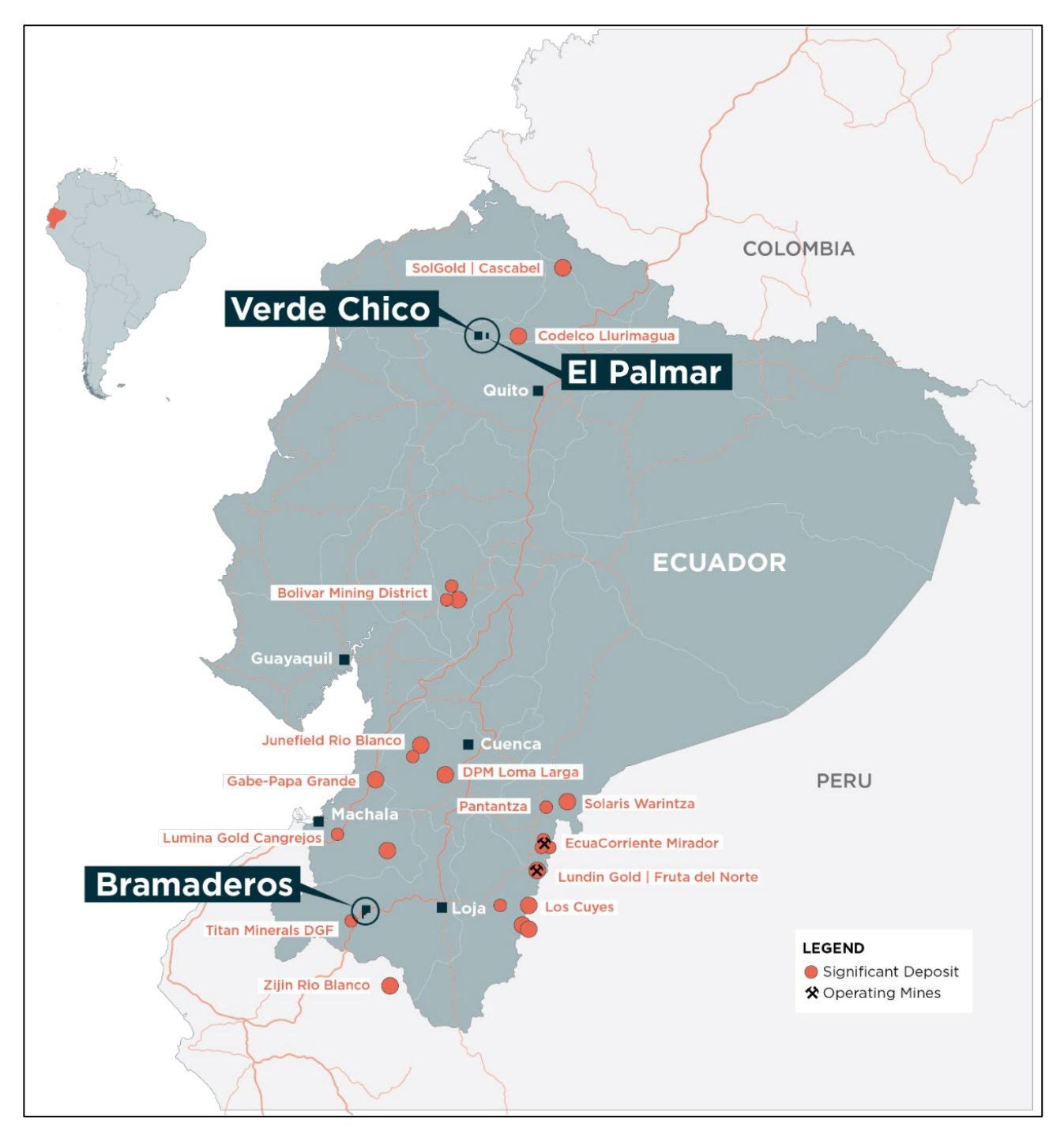
Figure 4: Location of Sunstone's Bramaderos and El Palmar projects, Ecuador.