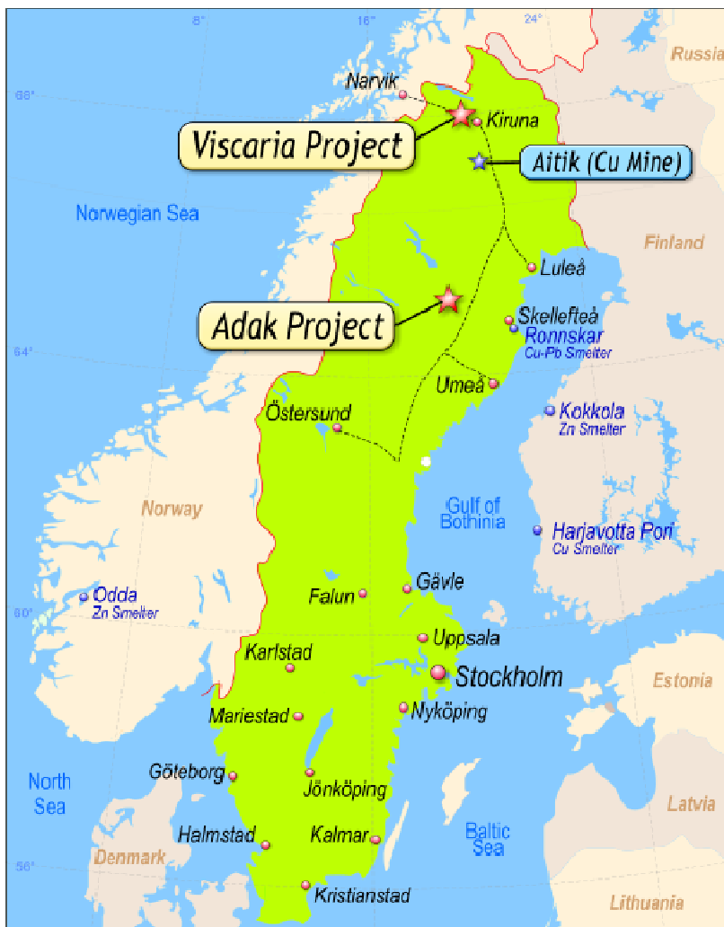
Figure 1 – Location map of Viscaria and Adak copper projects, Sweden

Avalon's corporate objective is to build a diversified resource mining group based on cash flows from producing operations. The primary project generation strategy has been successful with the acquisition of the advanced Viscaria copper deposit in northern Sweden where a maiden JORC Code compliant copper resource comprising an Inferred Resource of; 8.2 million tonnes grading 2.7% Cu for the 'A' Zone South, 5.1 million tonnes grading 1.2% Cu for the 'A' Zone North, 24.1 million tonnes grading 0.8% Cu for the 'B' Zone, and 2.5 million tonnes grading 1.6% Cu for the 'D' Zone, which combined totals 514,600 tonnes of contained copper. In addition the recently acquired cluster of six closed historical copper – zinc mines at Adak 300km south of Viscaria also provides potential for Avalon to grow its base metal inventory within northern Sweden.